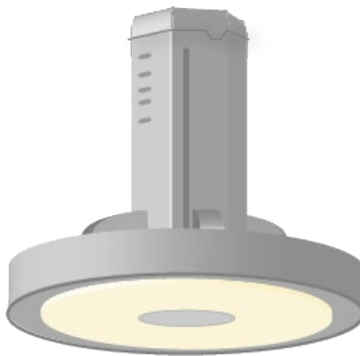
Figure 5: Isometric view of a high bay product with LEDs on the underside. The luminous shape would be represented by a 2D luminous circle, with length and width elements represented as negative values of the respective diameter (see LM-63 for details). If the luminous surfaces were on the sides as well, a vertical cylinder or rectangle with luminous sides would be used instead.