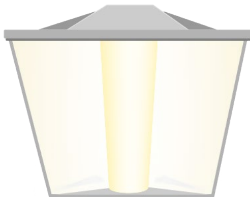
Figure 3: Isometric view of a troffer with a luminous basket and luminous panels on each side. The luminous shape would be represented by a 2D luminous rectangle because a complex shape is not permissible in LM-63.