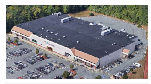
The building owner updated the building lighting for energy savings and improved lighting quality.