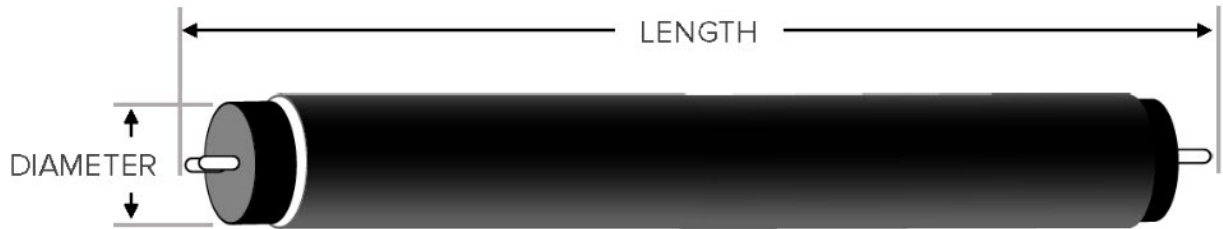
Figure 3. Dimensions of linear replacement lamps to be reported on the application form.